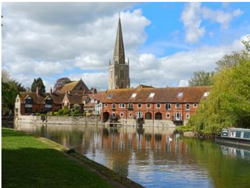
April in Abingdon