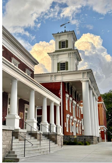
Washington County, Va. Courthouse