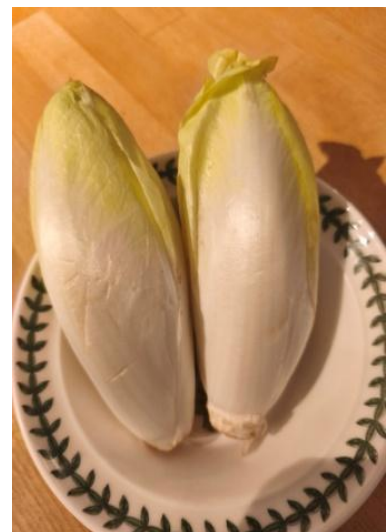
Endive (chicory family)

Preheat the oven to 200°C Cut a small piece from the bottom of each endive. Cook them until soft to the touch (boiling, steaming or braising) Drain and preserve the liquid. Protip: put a weight on the endive, to drain it completely. (Otherwise, the sauce in the oven tray will become watery) Make a bechamel sauce. Use the drained liquid to give it more flavour. Season with pepper, salt and nutmeg. Add the cheese gradually until the cheese sauce has your preferred consistency. Keep enough cheese separately to sprinkle on top of the dish. Butter an oven tray big enough to fit the row of endives. Wrap each endive in a slice of ham and place them on the bottom of the tray. Pour the cheese sauce over the wrapped pieces until they are covered. Sprinkle the rest of the cheese on top. Put in the oven for about 20 min. Serve with mashed potatoes.