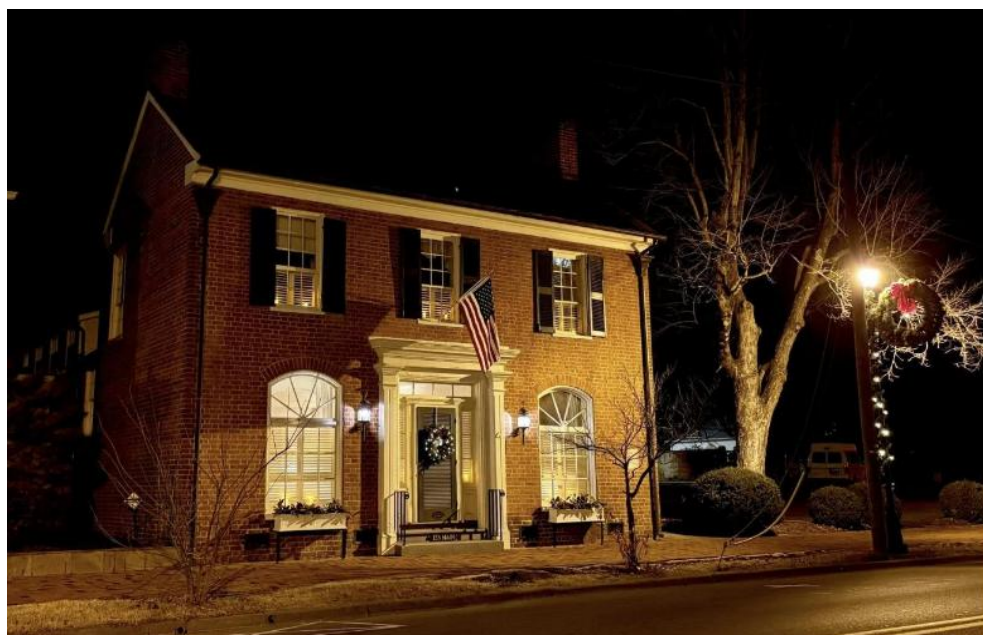
Philip Rohr House

Now that you have had a look at Abingdon, Virginia, USA we welcome your visits at any time!