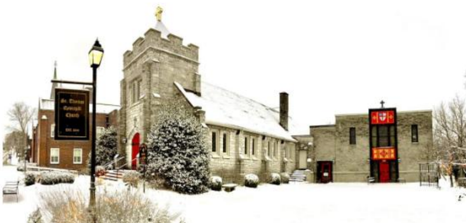
St. Thomas Episcopal Church Note: This church is located on Main Street in Abingdon, Virginia. The building was completed in 1925 after fire destroyed the original frame church building in 1924.