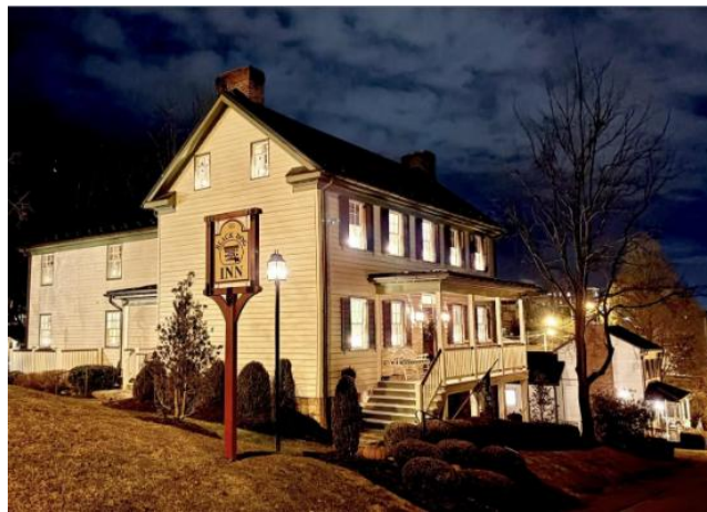
Black Dog Tavern