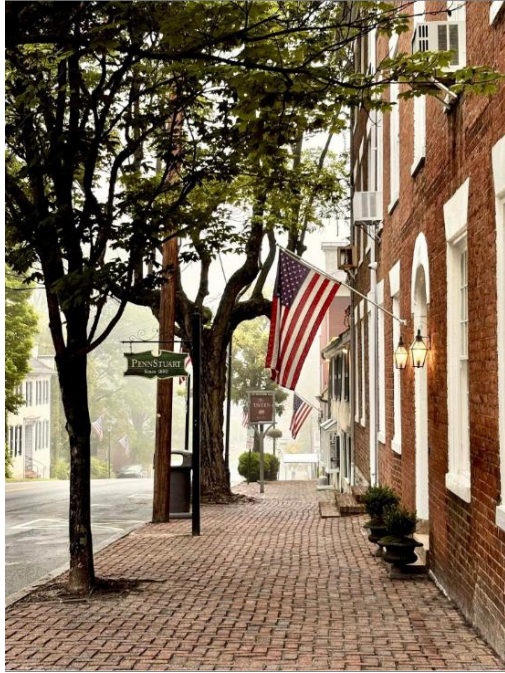
Main Street, Abingdon, Va