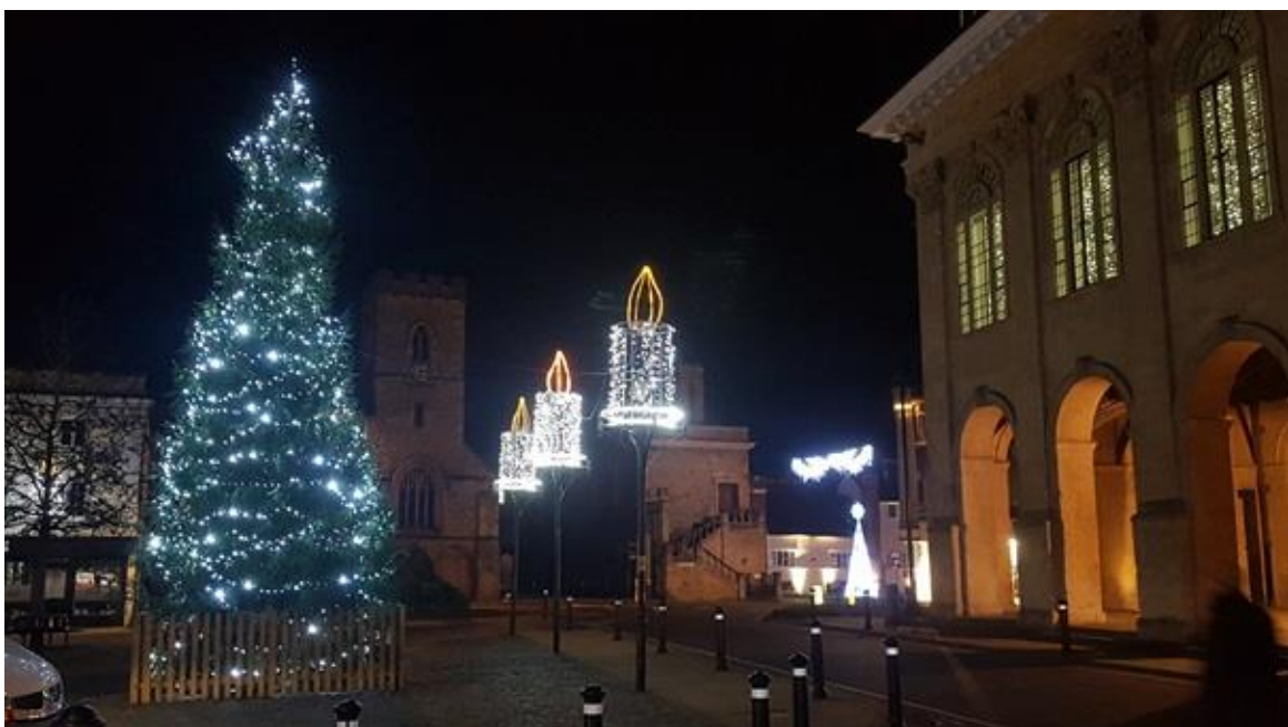
Abingdon Market Place at Christmas

The deadline for copy for the next newsletter is two days before the end of the month. Please send contributions to newsletter@adtts.eu . (No publication in August)