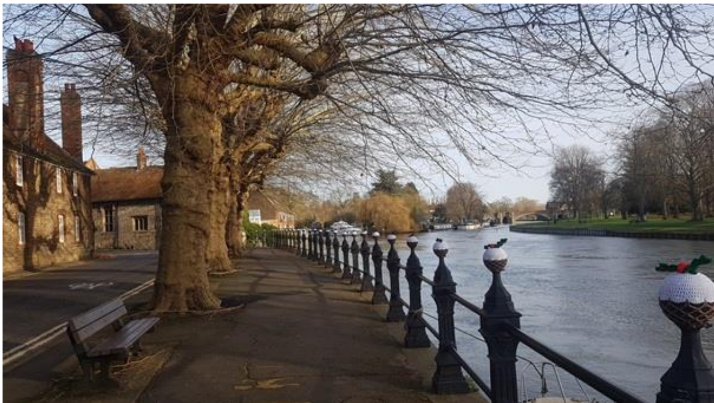
Abingdon Wharf in December 2023 with seventy-five Christmas puddings

The website also has reports, with pictures, of all twinning events going back to 2007. Note, that to save typing the full domain name, the address of the website may be shortened to www.adtts.eu . (Indeed, even the ubiquitous 'www.' may be omitted.)