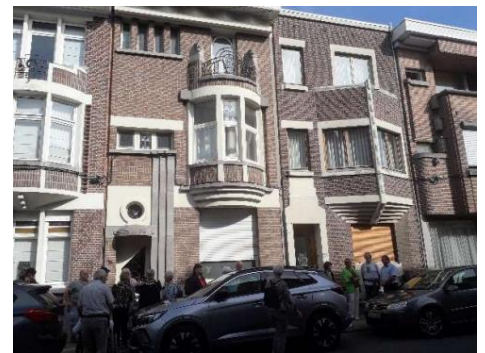
Art Deco Sint-Niklaas

We arrived back in Sint-Niklaas in time to see the hot air balloons rising from the Market Square. There were some amazing designs and the weather was perfect. Back in the Market Square, after dinner with our hosts, there was an impressive firework display.