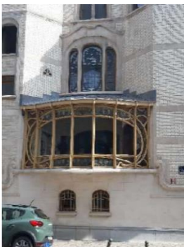
Maison Hannon Brussels