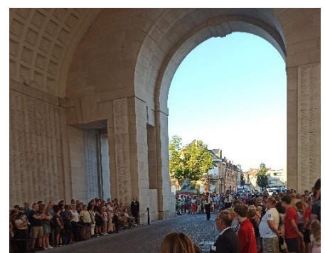
Last Post inside Menin Gate