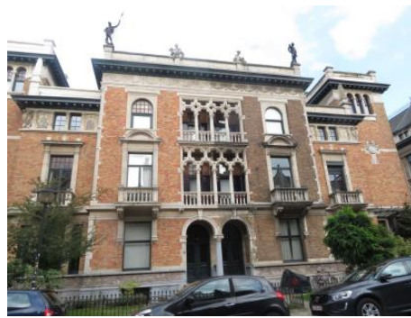
Art Nouveau House Antwerp