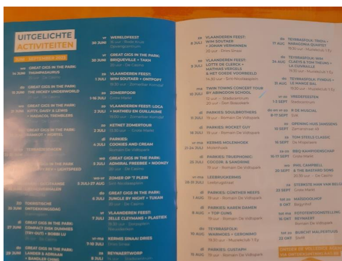
Mention in the Sint-Niklaas events magazine

Our twin town of Sint-Niklaas has put a lot of effort into publicising the concert in the Don Bosco church in Sint-Niklaas and below is a selection of the publicity from the Sint-Niklaas events magazine and city web pages.